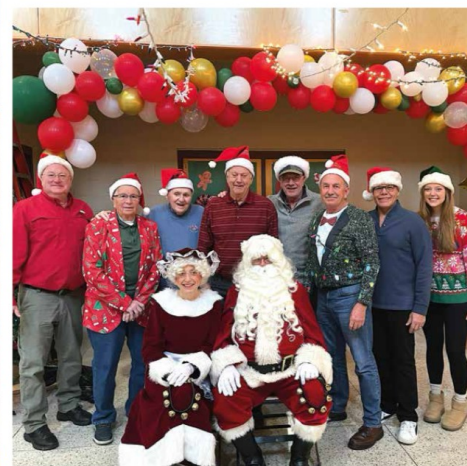
Dressed in seasonal attire, the club prepares to perform.