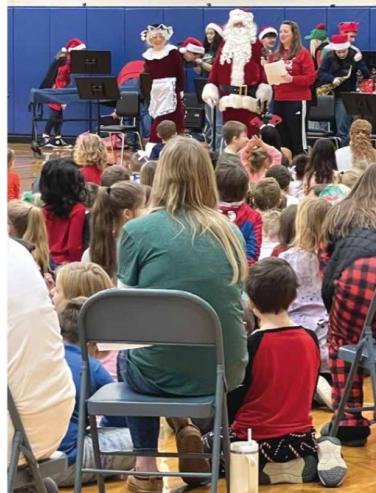
In front of an audience of children, the Exchange Club isn't afraid of looking silly.